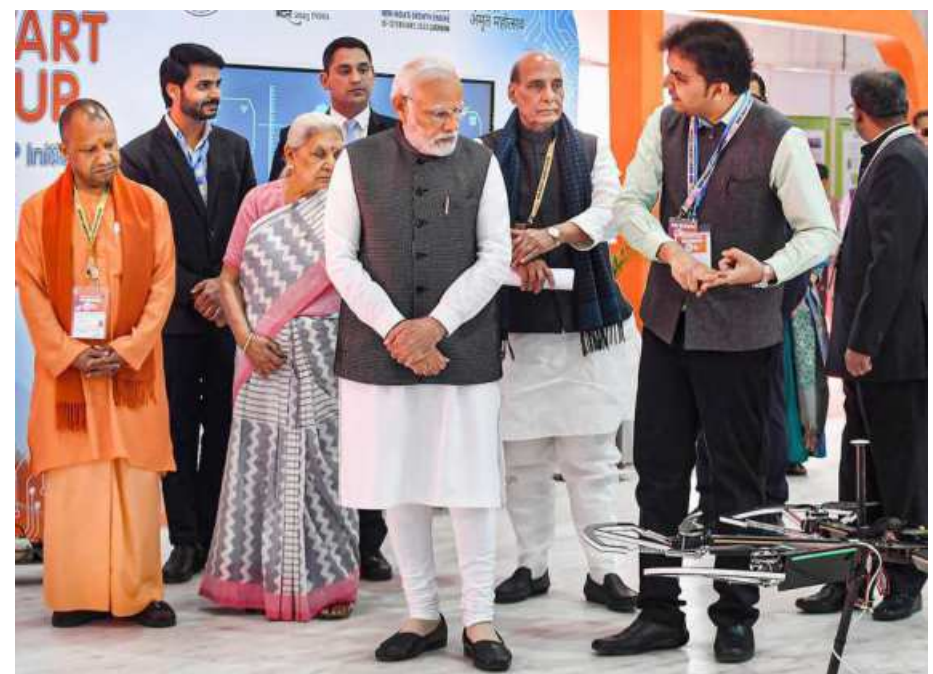
TECHNOLOGY TO THE FORE. Prime Minister Narendra Modi with Uttar Pradesh Governor Anandiben Patel, Defence Minister Rajnath Singh and Uttar Pradesh Chief Minister Yogi Adityanath at an exhibition organised during the Uttar Pradesh Global Investors Summit 2023, in Lucknow, on Friday.