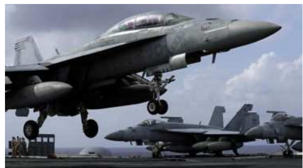
TOUCHDOWN. (file photo) An F/A-18 Super Hornet landing on the deck of the USS Ronald Reagan. The Indian Navy sees this as an option for the INS Vikrant.